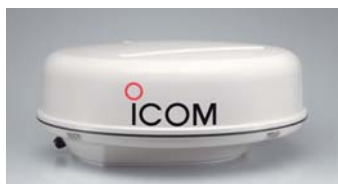
2-foot (60cm) radome scanner for MR-1200RII

MR-1200TIII: 72NM range, 6kW open array scanner