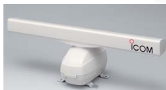
4-foot (120cm) open array scanner for MR-1200TII/TIII